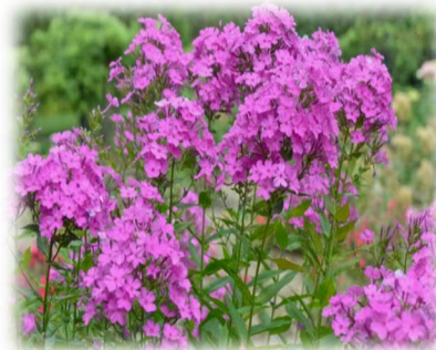
Phlox Robert Poore

Organic gardeners: dig it up carefully, making sure not to leave any part of the root ball behind.