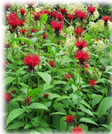
Monarda Jacob Cline