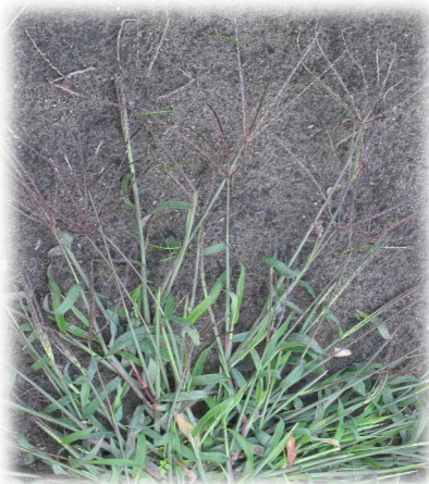
Crabgrass with seed head

Monarda ‘Jacob Cline’ (Pollinator Garden)- this 4-foot tall Beebalm, with its frilly bright red blossoms, attracts droves of pollinators and hummingbirds. ‘Jacob Cline’ will bloom all summer long! The foliage has a spicy fragrance that is unappealing to deer.