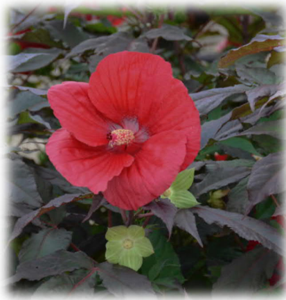
Hibiscus Midnight Marvel

I go to nature to be soothed and healed, and to have my senses put in order. —John Burroughs