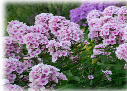
Phlox Bright Eyes