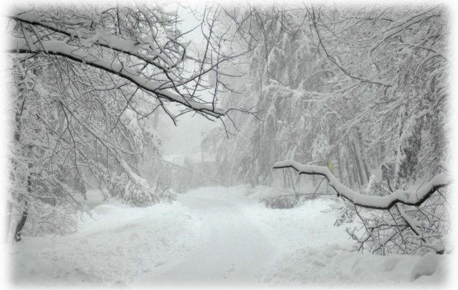
(One resident's approach to snow removal in our neighborhood)

I LOVE the snow! (When I have a nice warm house to retreat into for a warm up, that is). And I love snow shoveling as much as I hate lawn mowing, so keep this in mind if you decide to read on. The Pittsfield Village Condominium Association pays for and manages all snow removal on our streets and sidewalks, right up to the front doors. (We have an agreement with the City that keeps their giant, car-burying plows out of our neighborhood and gets our Association some reimbursement for our plowing costs).